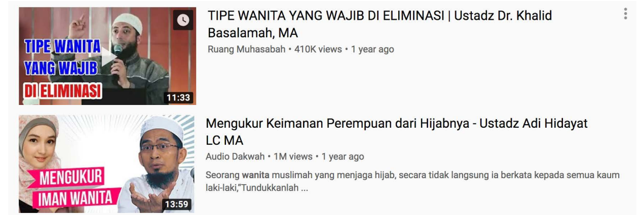
Fig 4. Screenshots of Youtube videos: 1) “Types of women that should be eliminated” 2) “Measuring a woman’s faith by her Hijab”

In Indonesia, where gender norms are so closely linked to religion, Islamist conservatives increasingly police women’s voices, bodies and images. In viral videos and through emphatic memes, self-appointed religious leaders deliver dramatic sermons about the right and wrong ways to perform